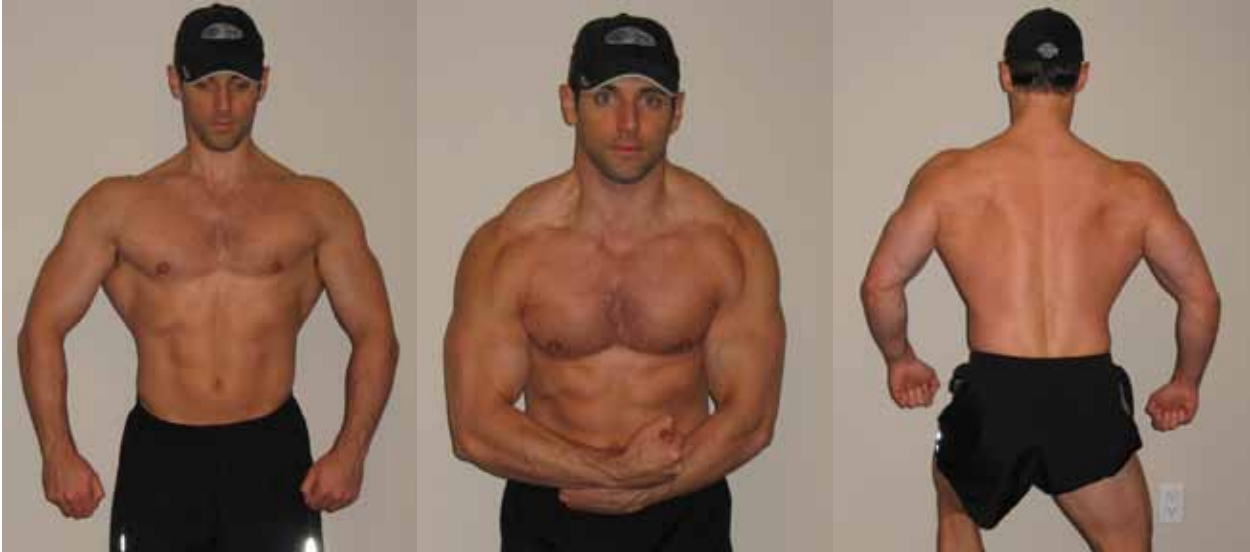
BEFORE FRONT AFTER FRONT

For those of you who prefer visuals, here are some before and after photos, documenting the changes I made: