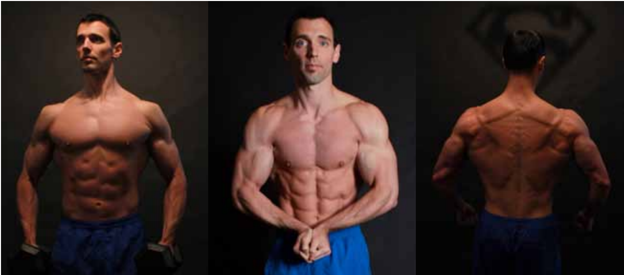
BEFORE BACK AFTER BACK