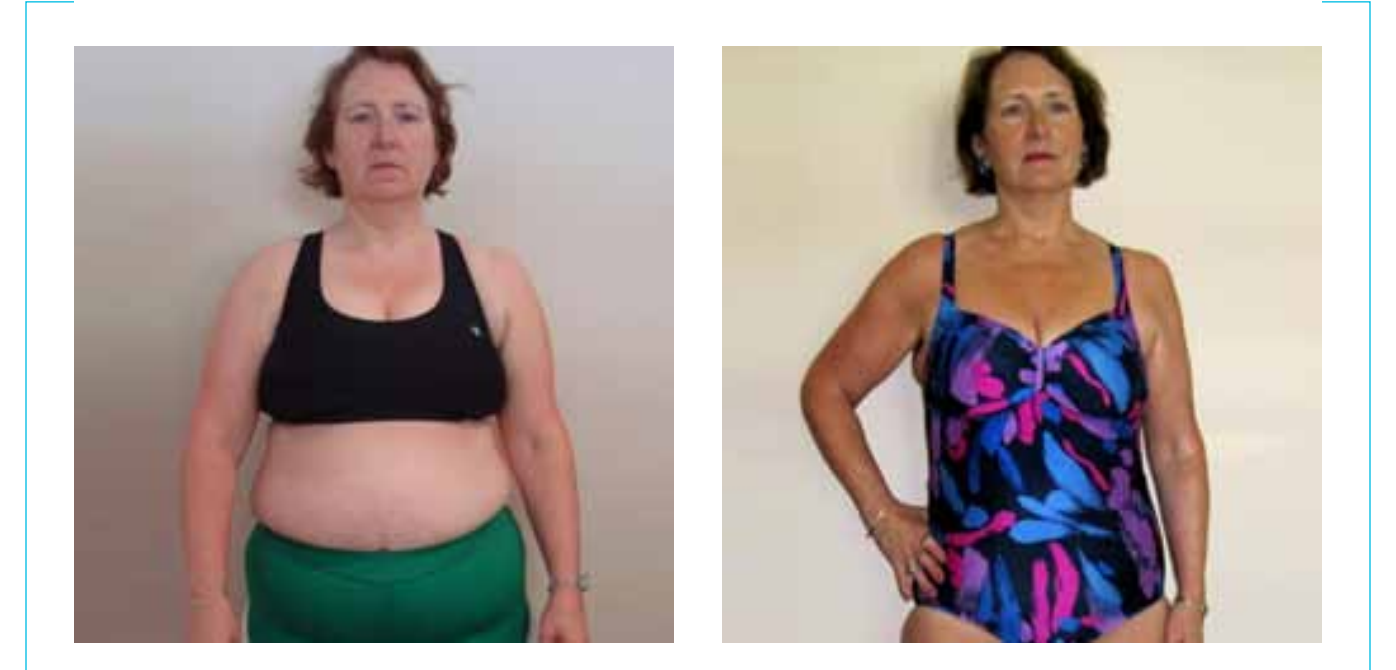
This client, a 55 year old female, lost 53 lbs and 25% body fat in 12 months